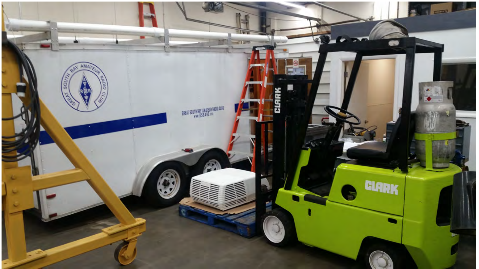
Above, getting ready to lift the HVAC system up to the trailer roof